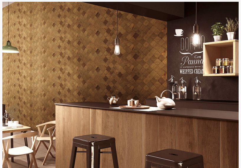
Geometrical Scallop (Forest Elements Mosaic Wood Wall Tiles)

ALPHARETTA, GA., UNITED STATES, May 10, 2021 /EINPresswire.com/ -- Concora, developer of the commercial building products industry's only Digital Experience Platform designed specifically for commercial building product manufacturers, and Surfacing Solution — a manufacturer of decorative wall panels and ceiling tiles for commercial and residential spaces — announced today that both companies have formed a strategic partnership.