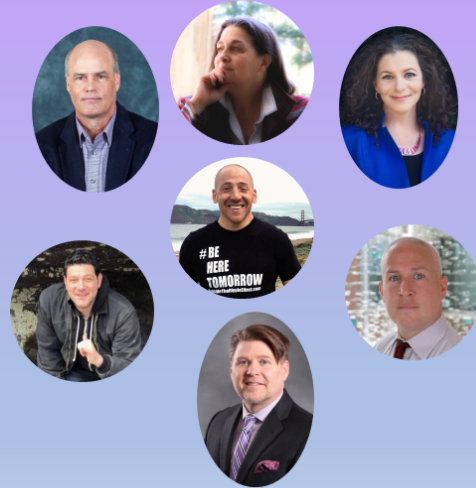
The "voices" of the Complexity of Murder-Suicide