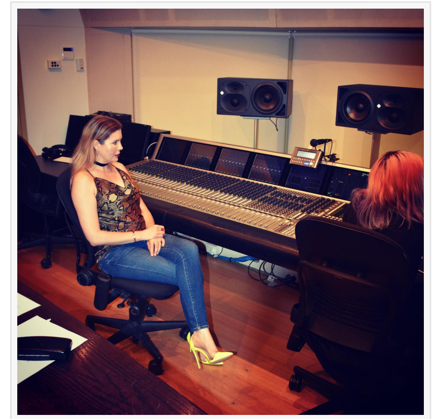
Trackdown Studios - Fox Studios Australia

Angelena Bonet Crystal Heart Productions info@angelenabonet.com Visit us on social media: Facebook Twitter LinkedIn