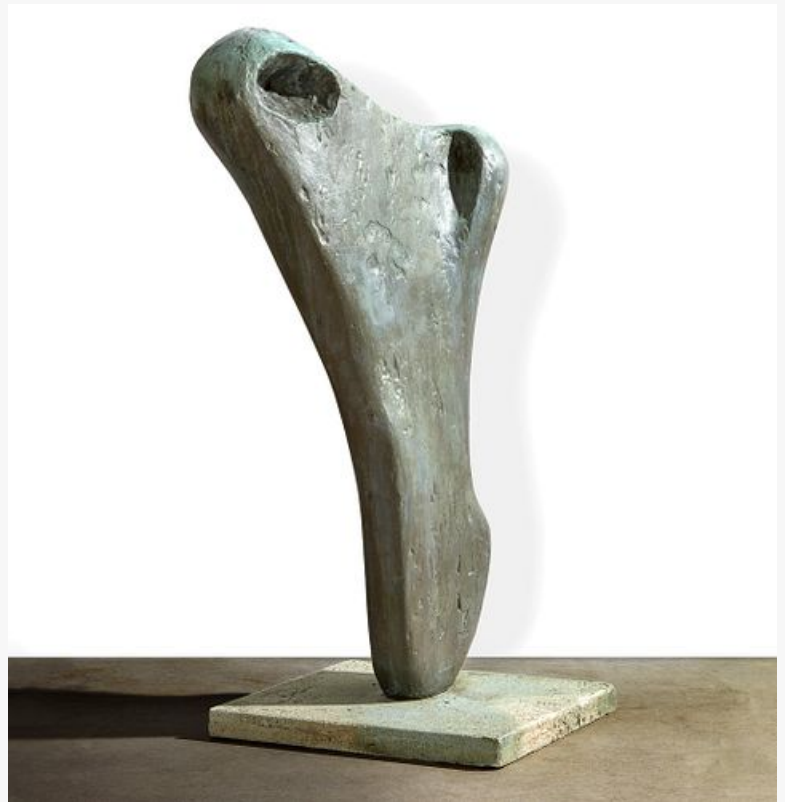
Barbara Hepworth (British, 1903-1975) Torso II (Torcello)