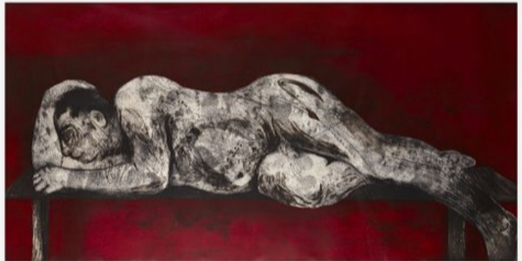
William Kentridge (South African, b. 1955) Sleeper Red from Sleeper Series

https://www.bidsquare.com/online-auctions/freemans/william-kentridge-