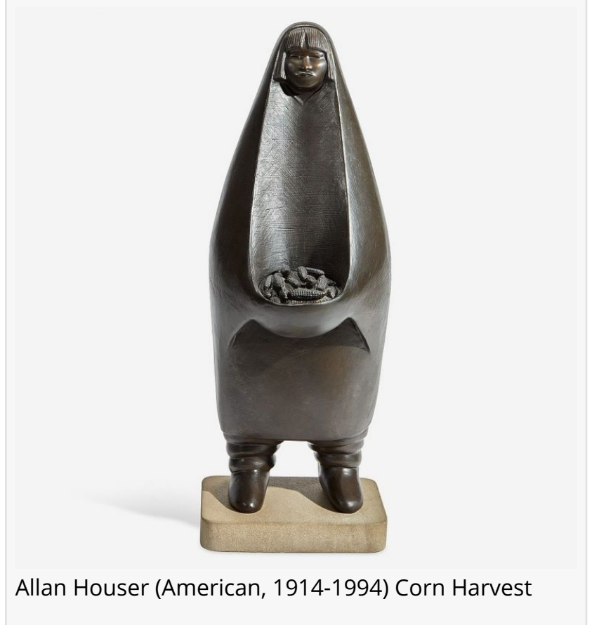
Allan Houser (American, 1914-1994) Corn Harvest