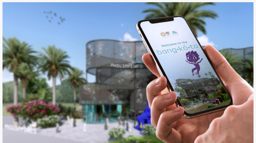
The 'Mobile Visitor Journey' app created by BBDO Guerrero, with Ube Boy as its virtual tour guide

The app is available for download on the App Store and Google Play. The app features a virtual tour guide, Ube Boy, who provides information about various Philippine destinations and attractions. The app is designed to be user-friendly and engaging, with a focus on providing accurate and up-to-date information. The app is a key component of PTA's digital marketing strategy to attract international tourists and promote Philippine tourism.