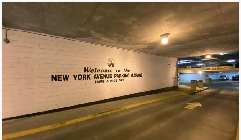
17-27 S New York Ave, Atlantic City

This press release can be viewed online at: https://www.einpresswire.com/article/540218334