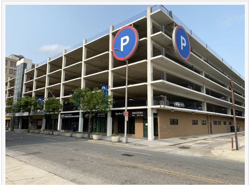
229,474+/- sq. ft., Atlantic City, NJ

ATLANTIC CITY, NJ, USA, May 4, 2021 /EINPresswire.com/ -- Max Spann Real Estate & Auction Co is pleased to announce the sale of an Atlantic City Parking Garage located at 17-27 South New York Avenue in Atlantic City, New Jersey. The 229,474+/- sq. ft. building will be sold by order of the South Jersey Transportation Authority in an online only Auction concluding Thursday, June 3, 2021 at 11:00 a.m. Bidders may bid on their computer or through the Max Spann phone app.