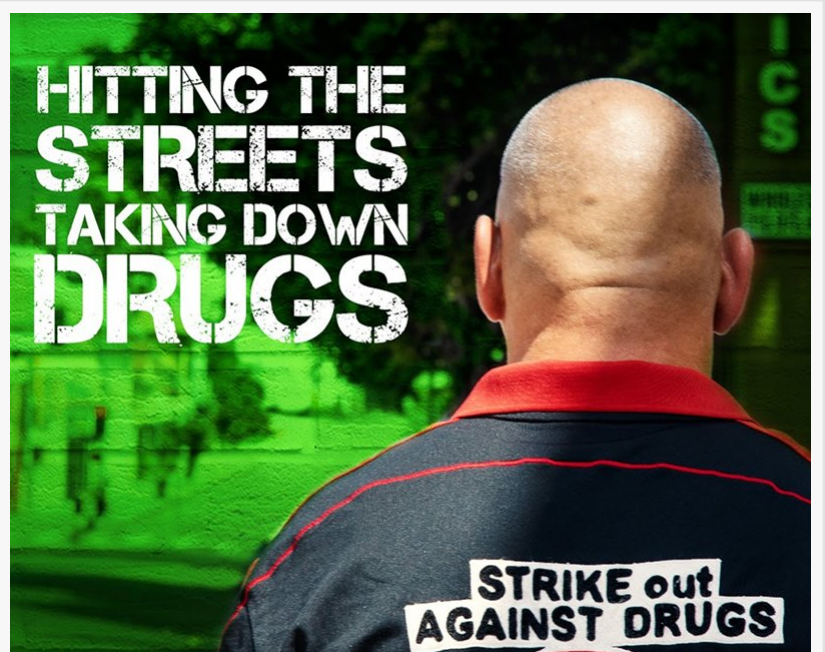
Scientology Network's Voices for Humanity episodes feature drug prevention activists