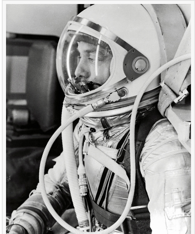
Astronaut Alan B. Shepard Jr., prepares for his Mercury Redstone 3 launch on May 5, 1961. Shepard's Freedom 7 Mercury capsule lifted off at 9:34 a.m. from Launch Complex 5 at Cape Canaveral Air Force Station. He became the first American to fly into space

Tuesday, May 4th, 2021: Today, uniphispace agency, a division of uniphispace good LLC, is proud to announce the line up for the sixth annual National Astronaut Day®, featuring an incredible line-up of Astronauts, musicians and entertainers, all participating in virtual, free, family-friendly