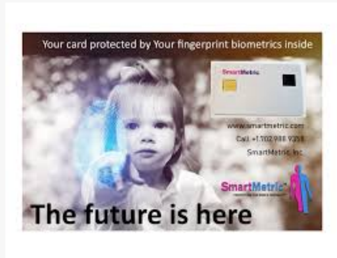
$SMME The Future