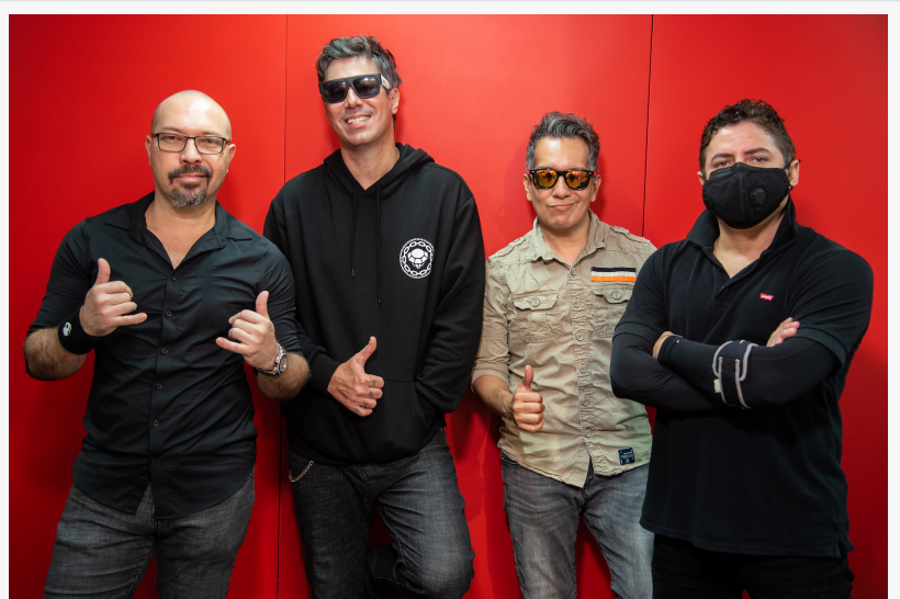
Los Rabanes Latin Grammy Winners

Los Rabanes shared with Los Auténticos Decadentes their admiration for Rubén Blades and