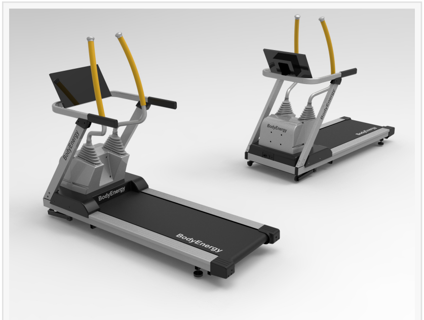
BodyEnergy treadmill: A New Human-Powered Treadmill for Safer, Greener, and More Complete Exercise

That's why BodyEnergy treadmills were developed in reaction to these fatalities and injuries that are too commonly accepted with current products. As the only company in the world that has been working to solve the treadmill-related problems since 2014, BodyEnergy has developed a