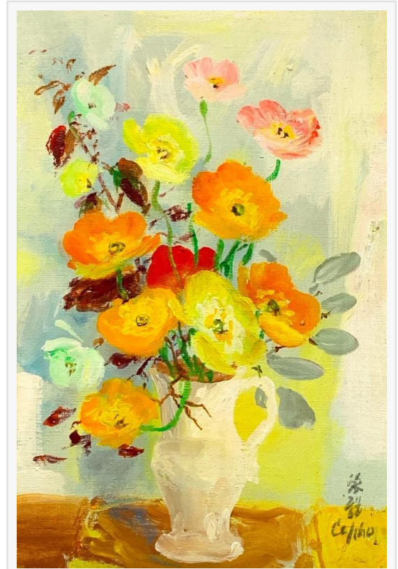
Lovely oil on canvas still life floral painting by the Vietnamese painter Le Pho (1907-2001), titled Fleurs (Flowers), artist signed lower right with a chop mark (est. $6,000-$9,000).

Neue Auctions invites everyone to be added to its email list to receive notifications and information regarding all current and future sales. For info, visit www.neueauctions.com . To learn more about Neue Auctions and the May Modernism auction planned for Saturday, May