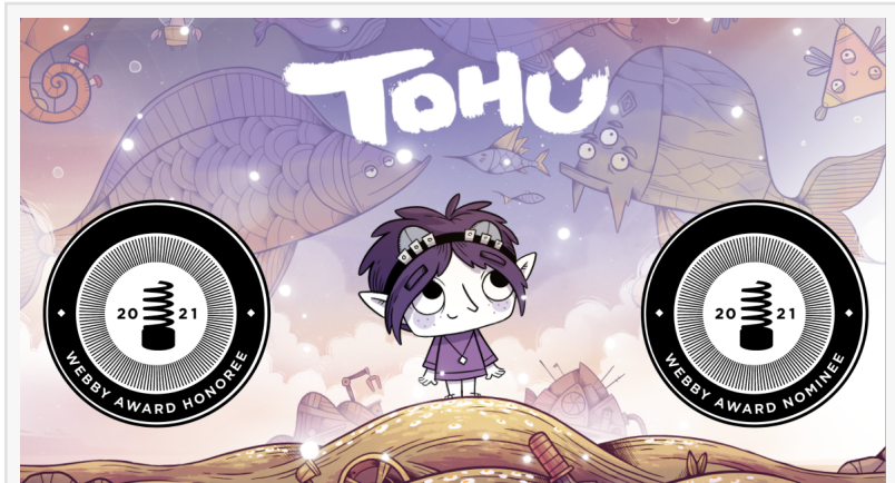
TOHU became a Webby Award Honouree & Webby Award Nominee

As a Webby Nominee, Fireart's work has been singled out as one of the five best in the world in its category (it's among the top 10% of the nearly 13,500 projects entered worldwide). Earning