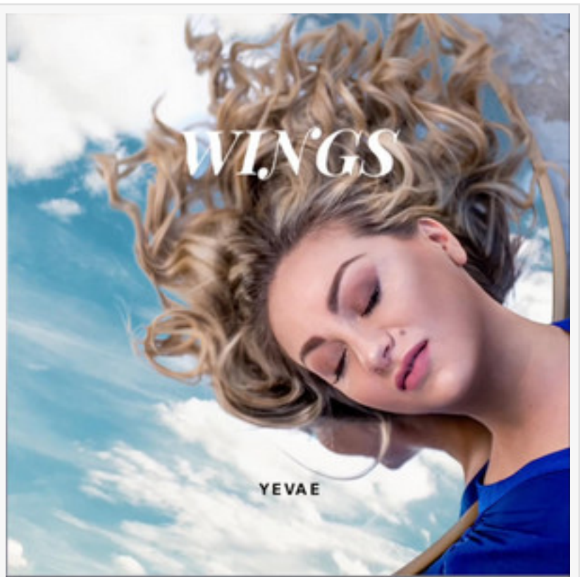
Yevae - Wings

This press release can be viewed online at: https://www.einpresswire.com/article/540341904