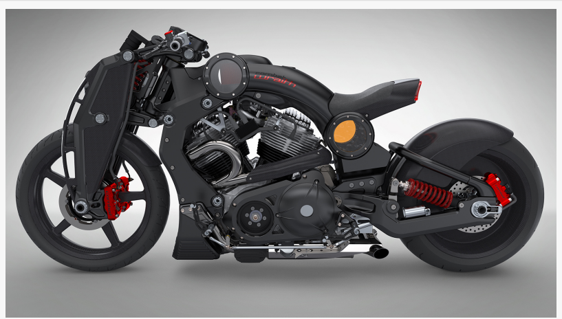
2021 Combat Knight Wraith