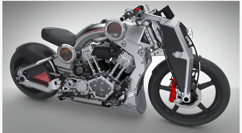
2021 Wraith in Raw Aluminum