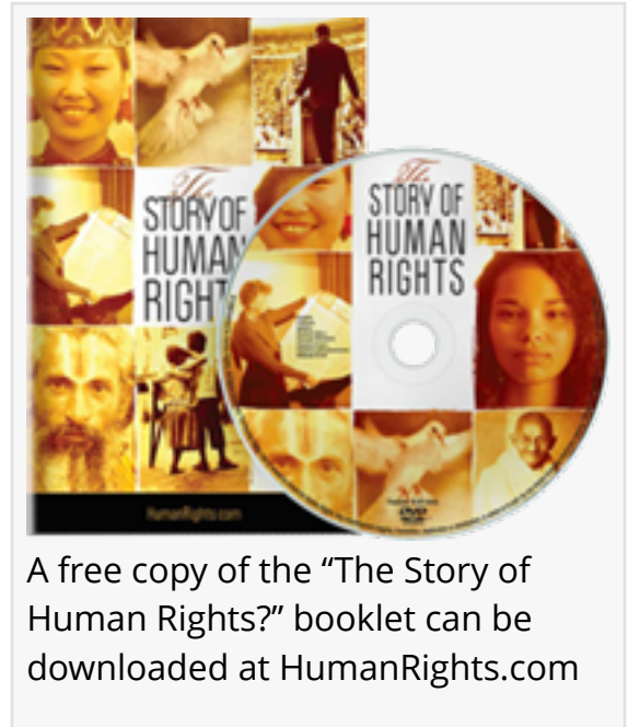
A free copy of the "The Story of Human Rights?" booklet can be downloaded at HumanRights.com

Dr. Martin Luther King, Jr. said , "The ultimate measure of a man is not where he stands in moments of comfort and convenience, but where he stands at times of challenge and controversy."