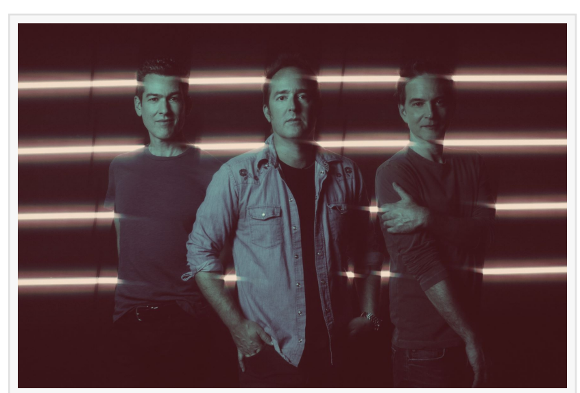
GRAMMY® Nominated, Multi-Platinum Rock Band TONIC Release New Astronaut & Space Inspired Music Video for If You Could Only See (25TH Anniversary) In Collaboration with National Astronaut Day & uniphi space agency

Video Celebrates Heroic Astronauts & 60th Anniversary of Human Space Exploration