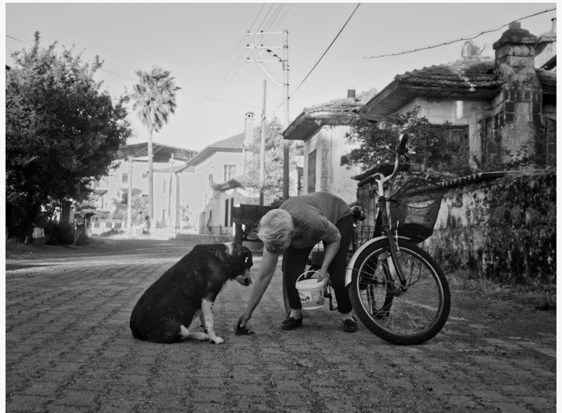
A Strange Season