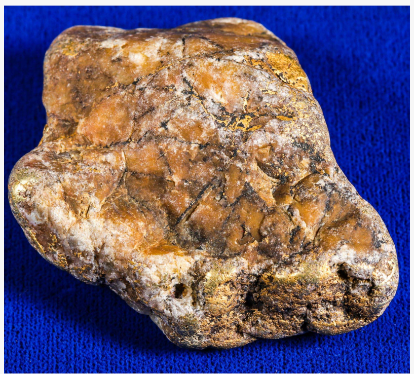
Gold metal and white quartz nugget gathered from the Knob Hill Mine in Republic, Washington, weighing 6.15 troy ounces and about 65 percent gold metal (est. $7,000-$9,000).

Day 3 lots will include a custom 14kt gold necklace with diamond bands and emerald eyes in a spotted leopard, plus gold and diamond earrings and leopard ring (est. $10,000-$15,000); and a silver ingot weighing 5.15 troy oz., engraved from Julius A. Turrill (White River / Pioche, Nev.), who