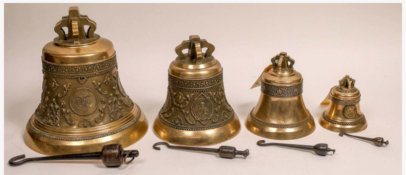
Rare and beautiful group of four Russian Orthodox Church bishop's bells, made in Russia circa 1997-2000, being offered as one lot (est. $1,600-$3,200).