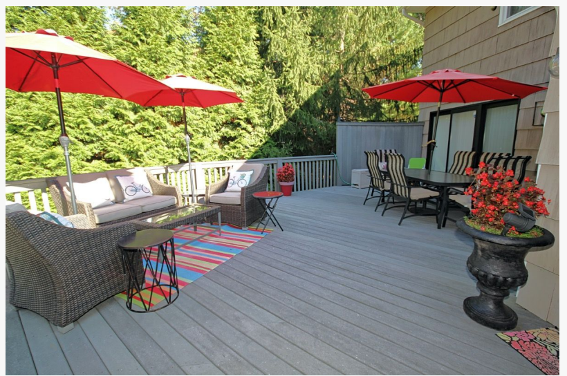
Patio To Right Side

The priceless glowing smile and look of amazement on your child's face, when he or she catches their first 3pound bass at nearby Turkey Swamp park, will be etched in both your and their memory forever. Growing up in my beloved Brooklyn, at age 9, my father took me to Prospect Park Lake we caught two fish. It was the happiest day of my life. My Dad died a year later, but I will remember forever how much fun we had fishing and how beautiful Prospect Park Lake was, and how happy I was to share an orange drink