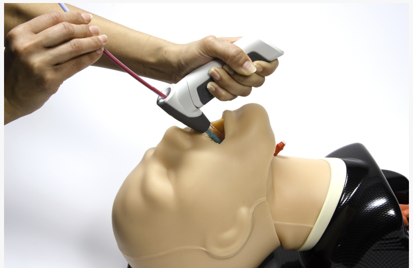
Vie Scope and Voir Bougie in use