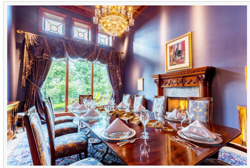
Luxurious custom details and finishes

The prestigious Quarry Creek area is a mountaintop community near the bend of the Kanawha River in Charleston, West Virginia. The estate is spoiled by both mountain and city views and proximity to downtown. Charleston boasts two riverfronts on the Elk and Kanawha Rivers and plays host to walkable historic neighborhoods, art galleries, cultural activities, boutique shopping, and dining. Venture downtown and enjoy free concert tickets at Haddad Riverfront Park or travel to three golf