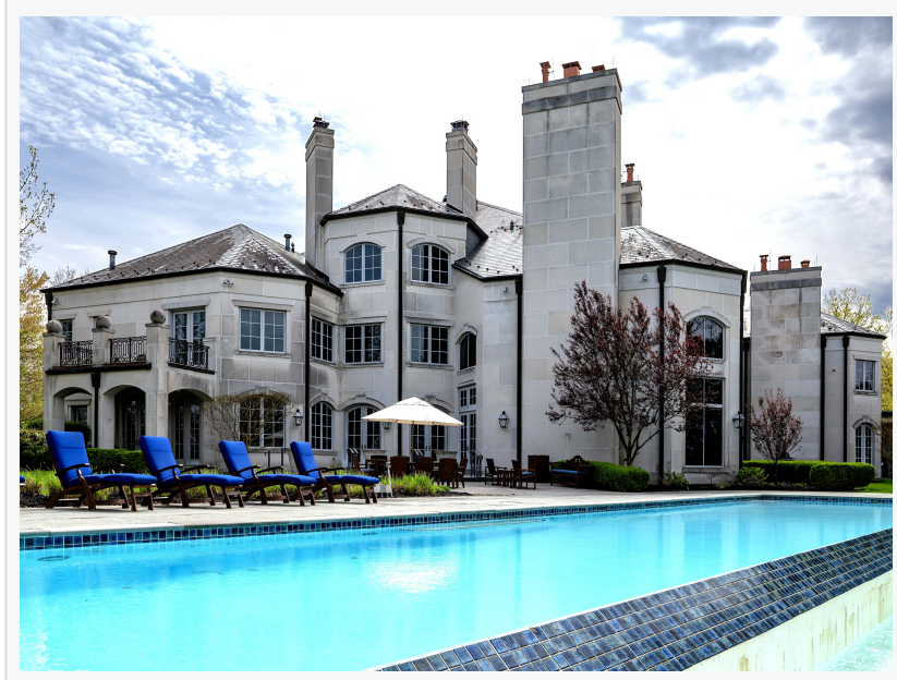
A backdrop for year-round entertaining

This press release can be viewed online at: https://www.einpresswire.com/article/540534235