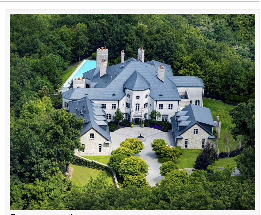
European-style stone estate

NEW YORK, NEW YORK, UNITED STATES, May 7, 2021 / EINPresswire.com/ -- Filled with luxurious custom details and finishes, 230 Quarry Ridge East, will auction via Concierge Auctions in cooperation with Amanda Neville of Old Colony, Realtors®. Currently listed for $13 million, the property will sell with No Reserve to the highest bidder. Bidding is scheduled to be held June 4–9 via Concierge Auctions' online marketplace, ConciergeAuctions.com,