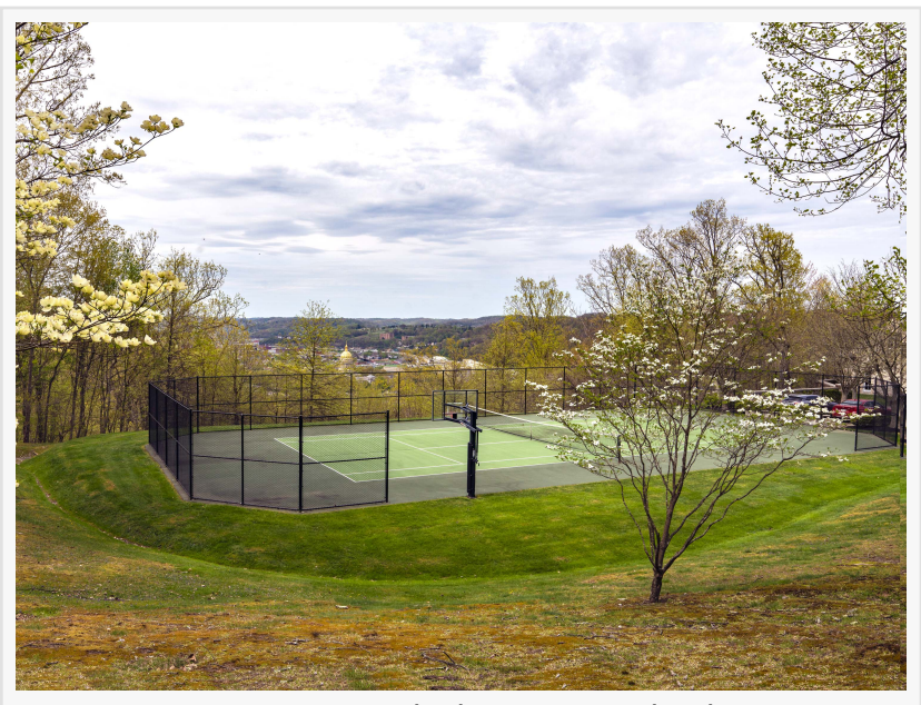
Mountaintop setting with downtown Charleston views