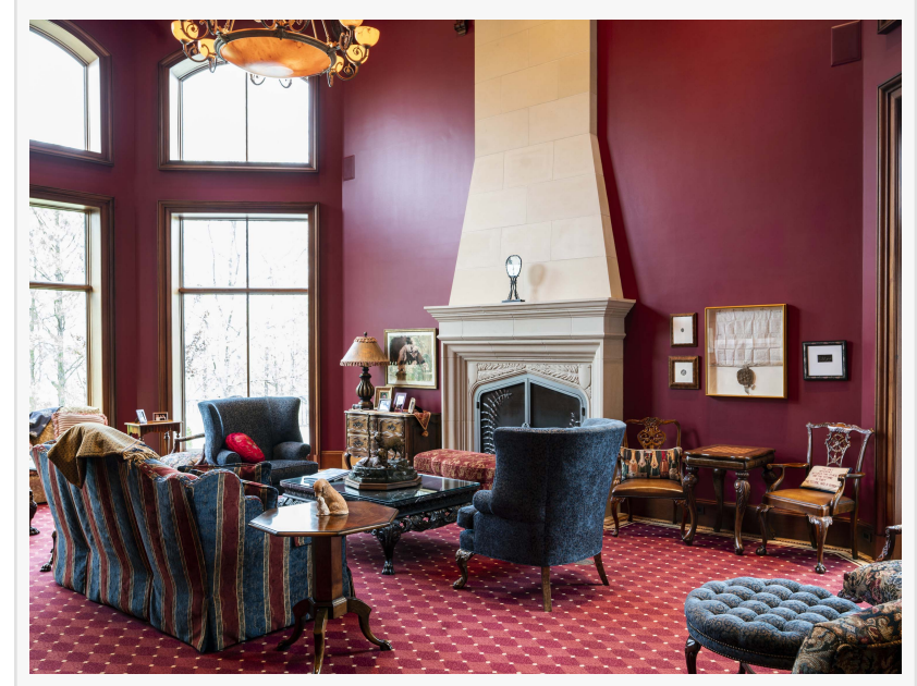
Artisan craftsmanship throughout the estate

courses within 20 minutes of the front door. For outdoor recreation, grab a stand-up paddleboard or kayak, join a river expedition, or enjoy a hike in the Kanawha State Forest.