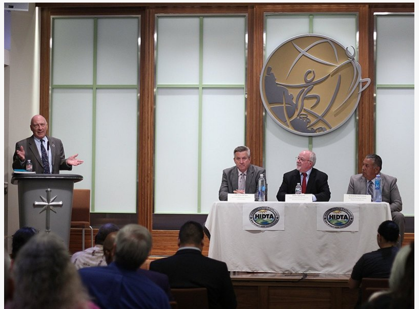
A drug prevention panel hosted by the Church of Scientology Sacramento