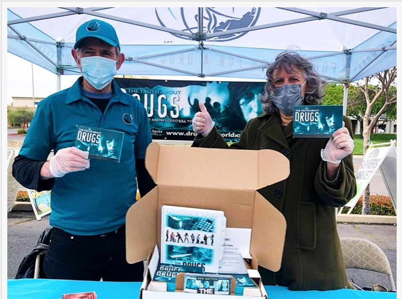
Truth About Drugs volunteers from the Church of Scientology Sacramento, California, share educational materials produced by Foundation for a Drug-Free World with families visiting a local fair.

The Foundation for a Drug-Free World’s Truth About Drugs program is based on the observation that no one, and especially not a young person, likes to be lectured about what he or she can or can’t do. Instead, the Truth About Drugs materials provide the facts that empower youth to decide for themselves not to take drugs. And that decision can mean the difference between their sharing Mother’s Day with their families for decades to come and senseless and irreversible loss.