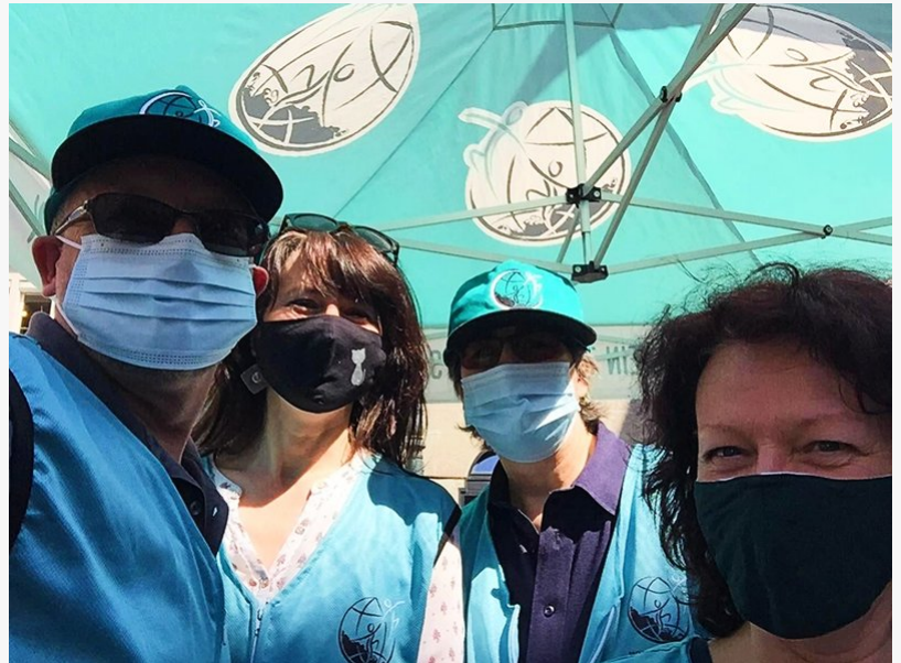
The Churches of Scientology of Paris set up information stands and provide Truth About Drugs booklets to anyone wishing to use them to help their families or friends.