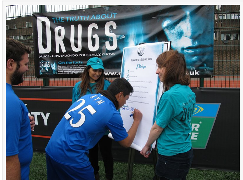
Teens in London, England, sign the Foundation for a Drug-Free World pledge to live drug-free.

EINPresswire.com/ -- With overdose deaths spiking across the country, some of the most tragic stories involve teens dying of fentanyl poisoning from counterfeit pills sold over social media. Churches of Scientology , active in drug education and prevention for more than 40 years, work with community partners to prevent these senseless tragedies by raising awareness about drugs and helping youth make the self-determined decision to live drug-free.