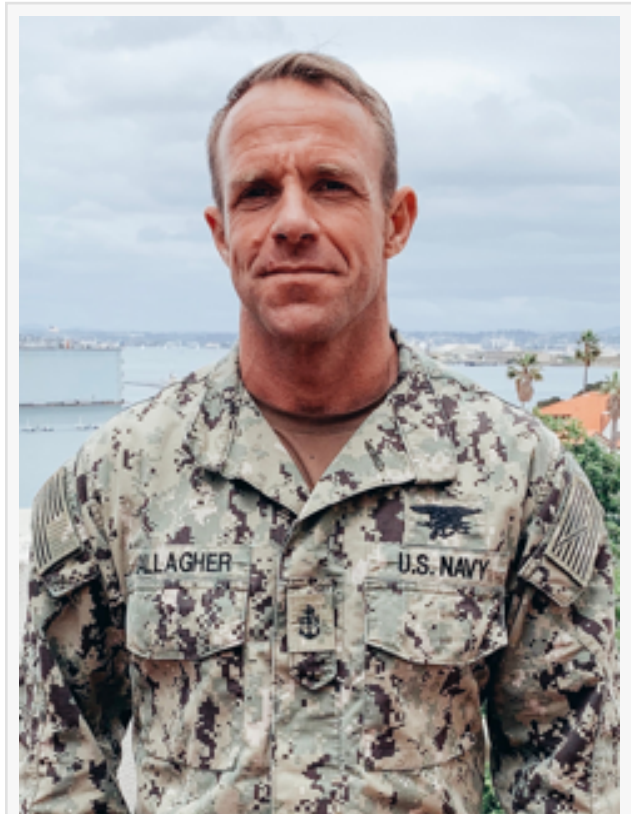
Navy SEAL Chief (Ret.) Eddie Gallagher

Eddie's treatment in particular, performing a cricothyrotomy, opened the terrorist's airway, which by all accounts, including video evidence, was very labored. According to the testimony of Corey Scott, that breathing had improved significantly after Eddie finished.