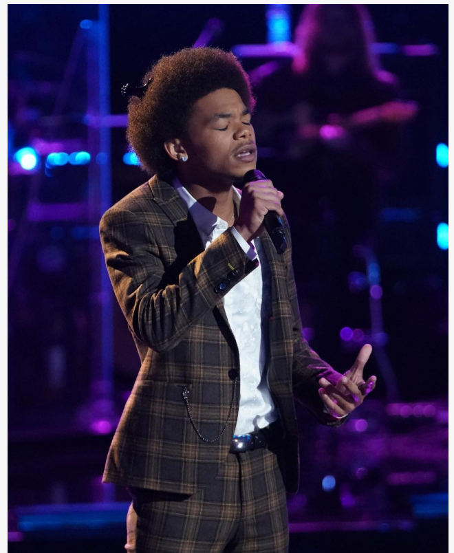
Cam Anthony performing "Feeling Good" by Icon, Nina Simone.

“It has been exciting to be a part of Cam’s evolution and watch him grow as an artist,” said