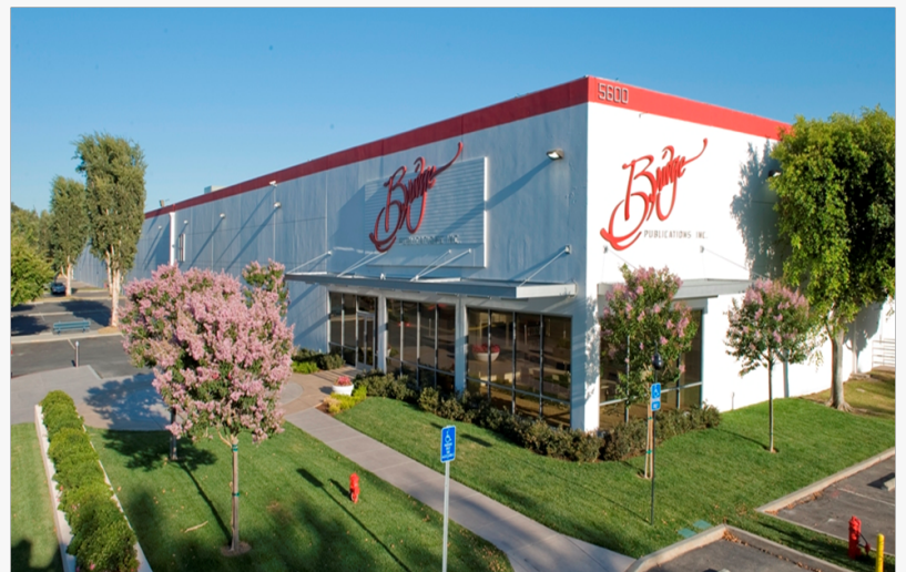
Bridge Publications, publisher of the nonfiction works of writer, humanitarian and Scientology Founder L. Ron Hubbard

LOS ANGELES, CALIFORNIA, UNITED STATES, May 9, 2021 / EINPresswire.com/ -- On the eve of the 71st anniversary of the publication of Dianetics, Bridge Publications, publishers of the nonfiction works of L. Ron Hubbard , has been recognized for creative excellence for its commemorative leatherbound edition of Dianetics: The Modern Science of Mental Health.