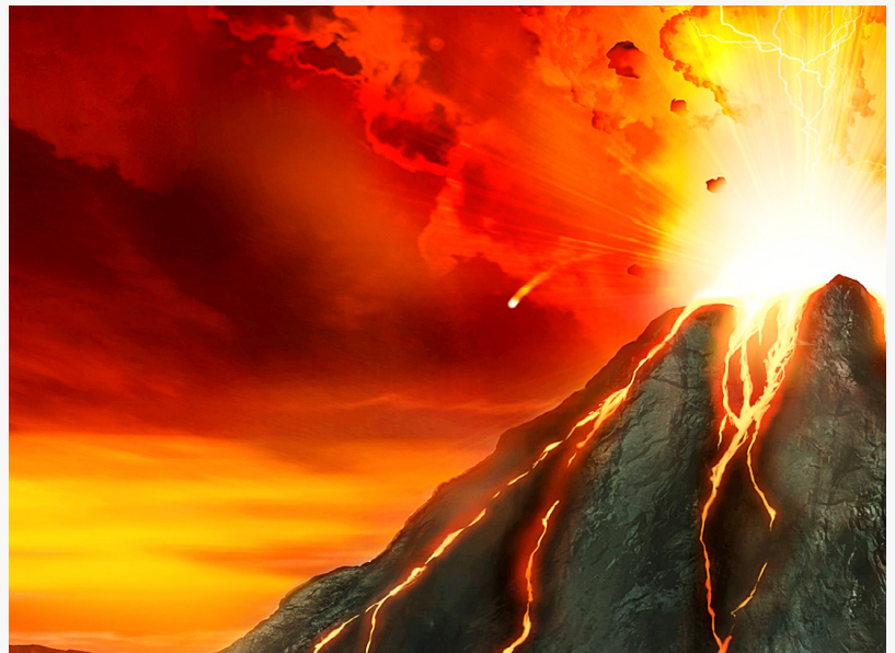
Scientists the world over celebrate May 9 as the anniversary of the first publication in 1950 of Dianetics: The Modern Science of Mental Health

First published on May 9, 1950, more than 50,000 copies of Dianetics: The Modern Science of Mental Health sold out immediately, propelling the book onto the New York Times bestseller list, where it remained for 26 consecutive weeks. Some 750 Dianetics groups sprang up across the