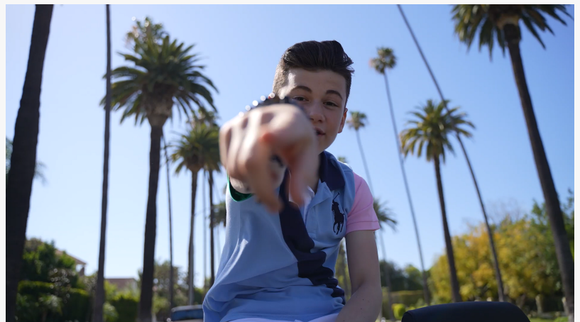
California Music Video: Beverly Hills

The high energy music video for California was filmed in Venice Beach, Beverly Hills, Hollywood