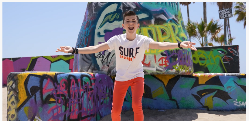
California Music Video: Venice Beach