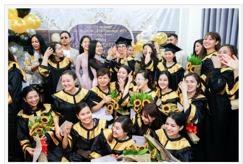
Miss Tram Academy is one of the best skin care professional school with high quality are trusted by thousands of students