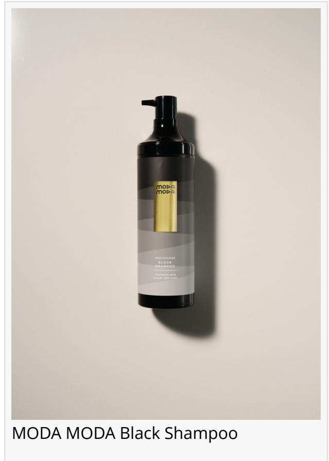
MODA MODA Black Shampoo

The application of such technology to MODA MODA's Pro-Change Black Shampoo enables an optimum sealing ability and minimizes oxidization of shampoo formula. The patented