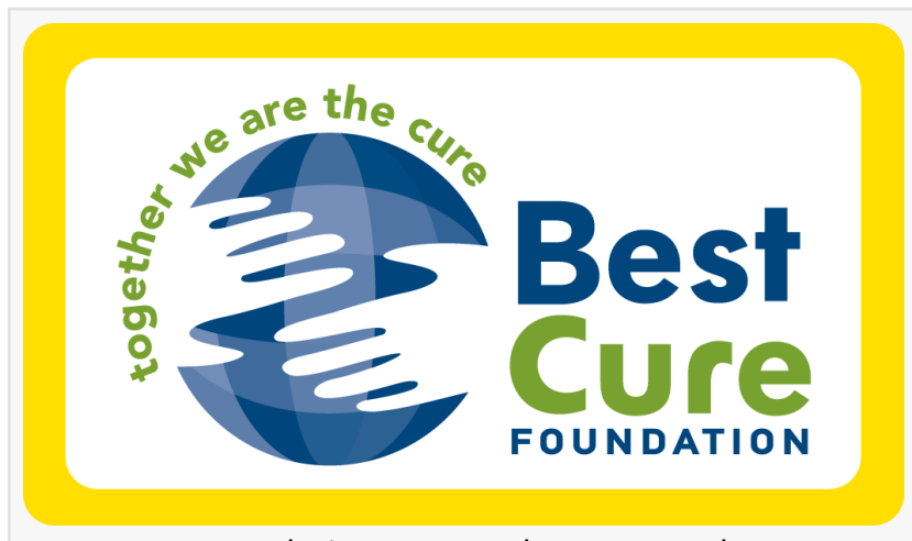
Best Cure Foundation — www.bestcure.md

a book about this titled, "The Words That Work".