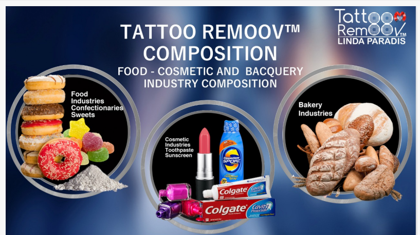
Tattoo Remoov Composition

It does not require anesthesia due to minor discomfort, does not cause bleeding or inflammation and does not create scars. The Tattoo Removal product is composed of neither