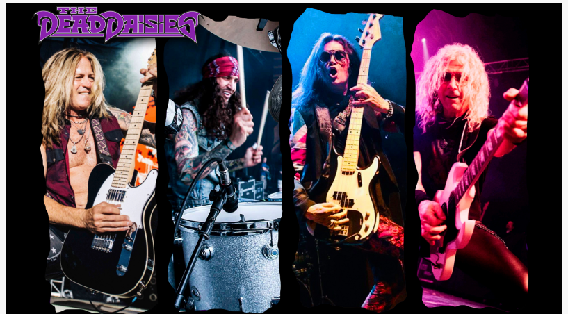
The Dead Daisies

SYDNEY, AUSTRALIA, May 12, 2021 /EINPresswire.com/ -- Individually, the members of The Dead Daisies are all high-ranking artists and veterans in the music industry. The current roster of the supercharged group features guitarist Doug Aldrich (Whitesnake, Dio), drummer Tommy Clufetos (Black Sabbath, Ozzy Osbourne, Alice Cooper), bassist and singer Glenn Hughes (Deep Purple, Black Country Communion), and rhythm guitarist David Lowy (Red Phoenix, Mink). But together? They're a force to be reckoned with. Undefeated and vigorous, the four-piece are doing their part to bring back rock and roll. Influenced by the 70s and 80s, they take after legends like Aerosmith, Bad Company, and Foreigner, their high-voltage rock songs incorporate modern trends, creating timeless music. We ask, and they deliver. They've topped charts and received plenty of airplay, and with their latest album, Holy Ground, The Dead Daisies present eleven infectious and thunderous tracks. Rock is undoubtedly here to stay.