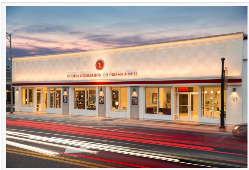
The headquarters for CCHR Florida are located in downtown Clearwater.

CLEARWATER, FLORIDA, UNITED STATES, May 12, 2021 /EINPresswire.com/ -- In recognition of National Foster Care Month, the Florida chapter of the <u>Citizens</u> <u>Commission on Human Rights (CCHR)</u> is hosting a free virtual event on May 29th. Titled "<u>Foster Kids & The Baker Act</u>", the event is being held to bring attention to the flaws in the foster care system and how many of these