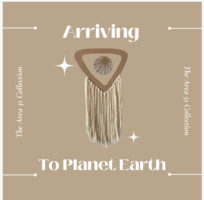
Nevada Sunrise Wall Art