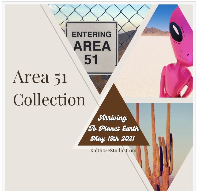
Area 51 Collection