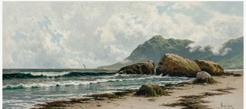
Oil on canvas by Alfred Thompson Bricher (American, 1837-1908), titled Low Tide, Grand Manan Island, signed, 15 inches by 33 inches, est. $20,000 - $30,000, sold for $60,000.