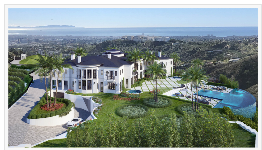
Stella Nova, 1400 Linda Flora Drive, Bel Air, CA

NEW YORK, NEW YORK, UNITED STATES, May 13, 2021 /EINPresswire.com/ -- Concierge Auctions is pleased to announce that Stella Nova, set in the foothills of the Santa Monica mountains with 30± buildable acres in the heart of Bel Air, is pending sale in cooperation with