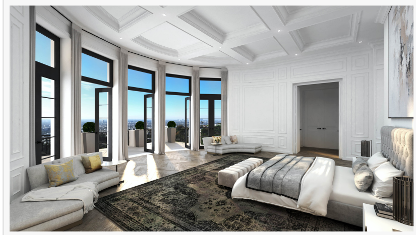
360-degree views of the Pacific Ocean to Downtown Los Angeles