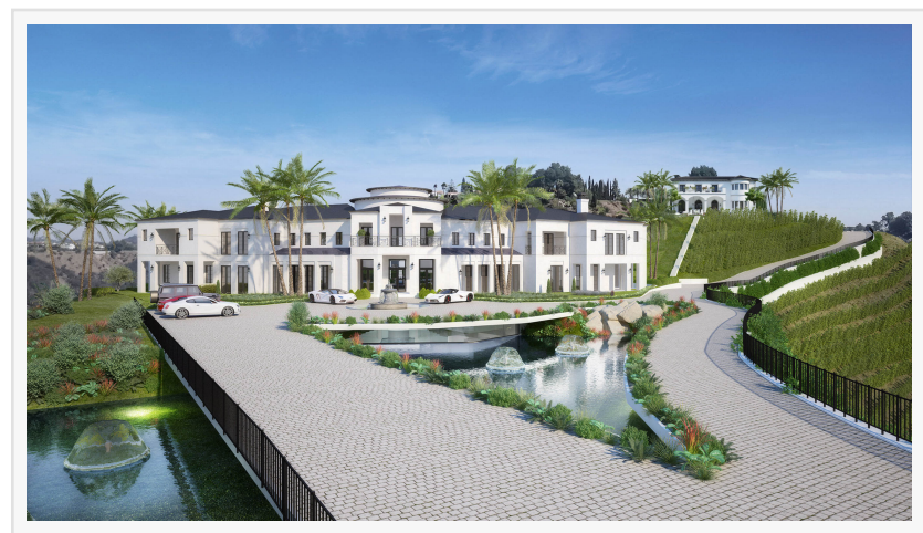
Pristine opportunity to create an estate beyond comparison

ConciergeAuctions.com or call +1.212.202.2940.