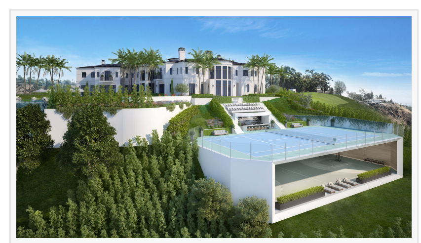
30± acres in the foothills of the Santa Monica mountains

Concierge Auctions is the world's largest luxury real estate auction firm with a state-of-the-art digital marketing, property preview, and bidding platform. The firm matches sellers of one-of-a-kind properties with the most high-net-worth property connoisseurs on the planet. Sellers gain unmatched reach, speed, and certainty. Buyers get incredible deals. Agents earn their commission in 30 days. Since its inception in 2008, Concierge Auctions has generated billions of dollars in sales, broken