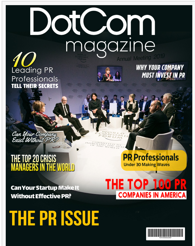
The DotCom Magazine Entrepreneur Spotlight Show