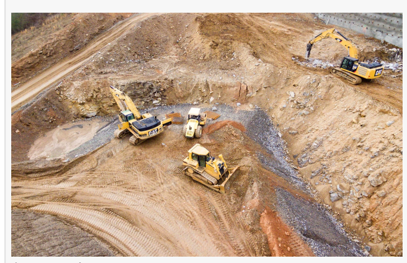
$BRLL Lithium Ion

Barrel Energy, Inc. (BRLL) is focused on several <u>ventures within the energy</u> and minerals sector as well as the rapid development of <u>valuable production opportunities</u>. Current BRLL projects are focused on the Lithium-ion battery business which is increasingly important for the rapidly emerging Electric Vehicle market to support new green energy initiatives. BRLL management is also working to improve its share structure and enhance shareholder value. On March 19thBRLL management posted on Twitter that 8,330,420 shares had just been returned to the company treasury.