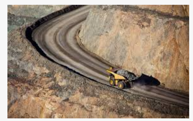
$BRLL Lithium Ion Batteries

Vehicles, Medical Equipment, Solar street lighting, the telecom industry as well as home energy storage solutions. Barrel and Roshan first plan to make a sizeable impact on the escalating small vehicle EV market in India, a country that has made ambitious policies towards the change to