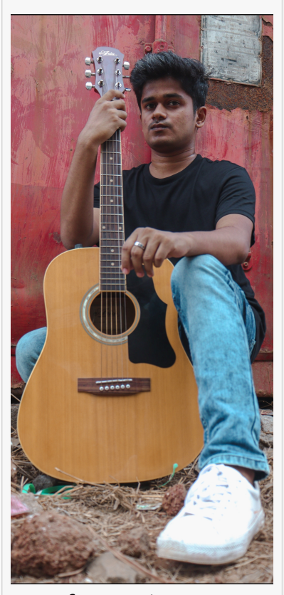
Love for music