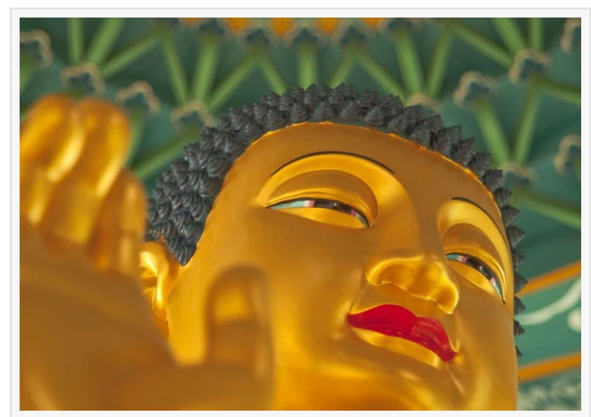
World Biz Magazine - Art Collectors Guide

creates timeless pieces of beauty in stone and metal. www.tomashbourne.com