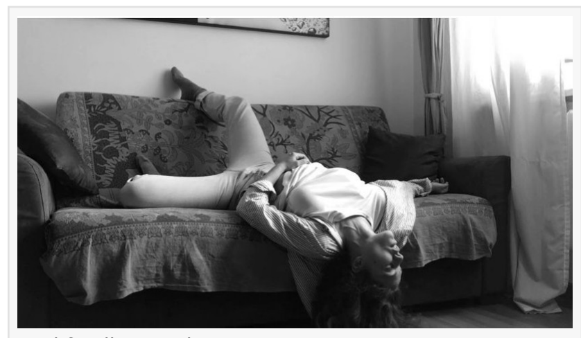
And finally searching in time

ANDRA TUTTO BENE by Carolina lelardi is a very joyful film, although it covers the same arid landscape of the covid pandemic. The short film shows us