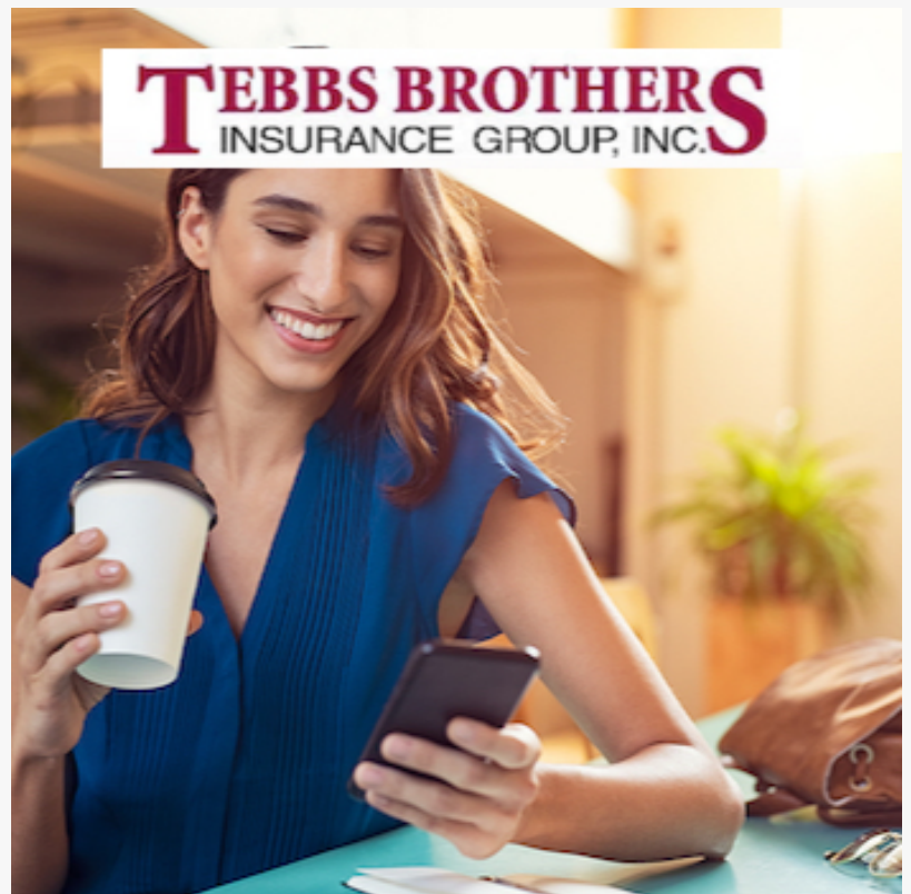
TEBBS Bros: UTAH's #1 BUSINESS Home Life Auto INS

TBIG is considered a Best-in-State (Utah) Auto-Home-Life-Business Insurance Provider since their inception in 1982. TBIG has consistently ranked in the Top 5 Insurance Providers in Salt Lake