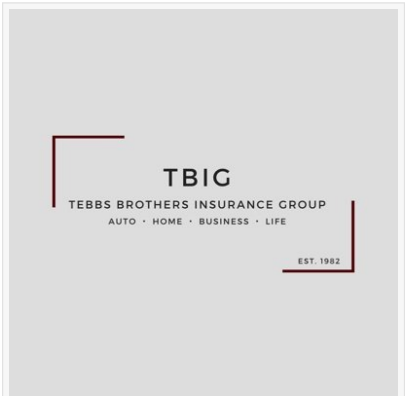
'Best of State' Insurance Murray UTAH: Top AUTO Life

As your personal situations change (i.e., marriage, birth of a child or job promotion), so will your LIFE insurance needs. Care should be taken to ensure this product is suitable for your long-term life insurance needs. You should weigh any associated costs before making a purchase. Life insurance has fees and charges associated with it that include costs of insurance that vary with such characteristics of the insured as gender, health and age, and has additional charges for riders that customize a policy to fit your individual needs. TBIG knows the secrets of good insurance coverage.