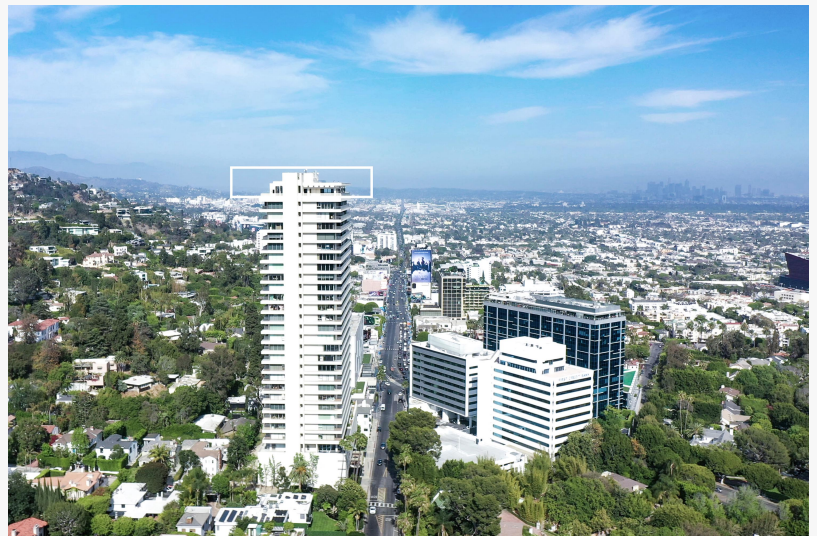
An ideal West Hollywood/Beverly Hills location, just off the Sunset Strip