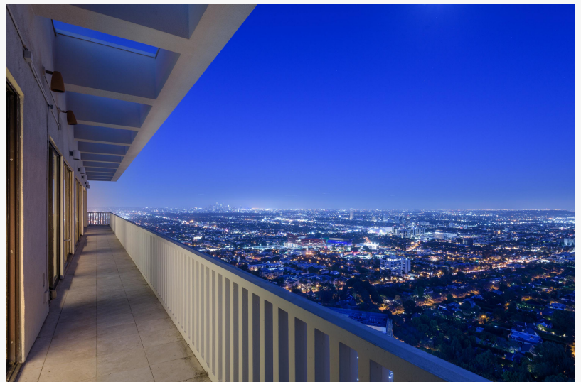
Featuring 4,000 square feet of outdoor living area and 360-degree unobstructed views