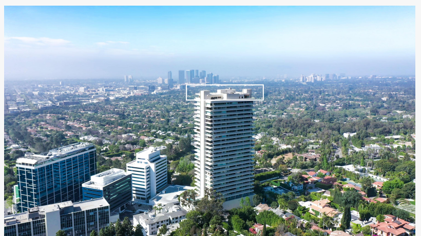
Sierra Towers Penthouse, 9255 Doheny Road #PH1 & 2, West Hollywood, CA