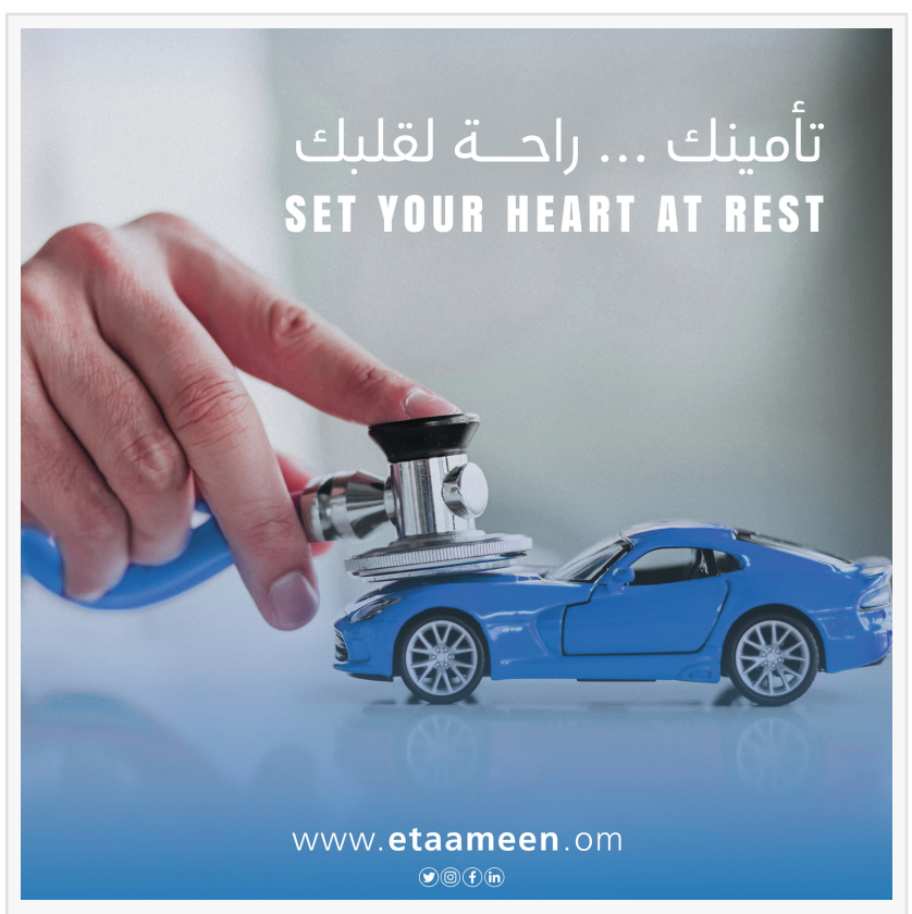
etaameen insurance car