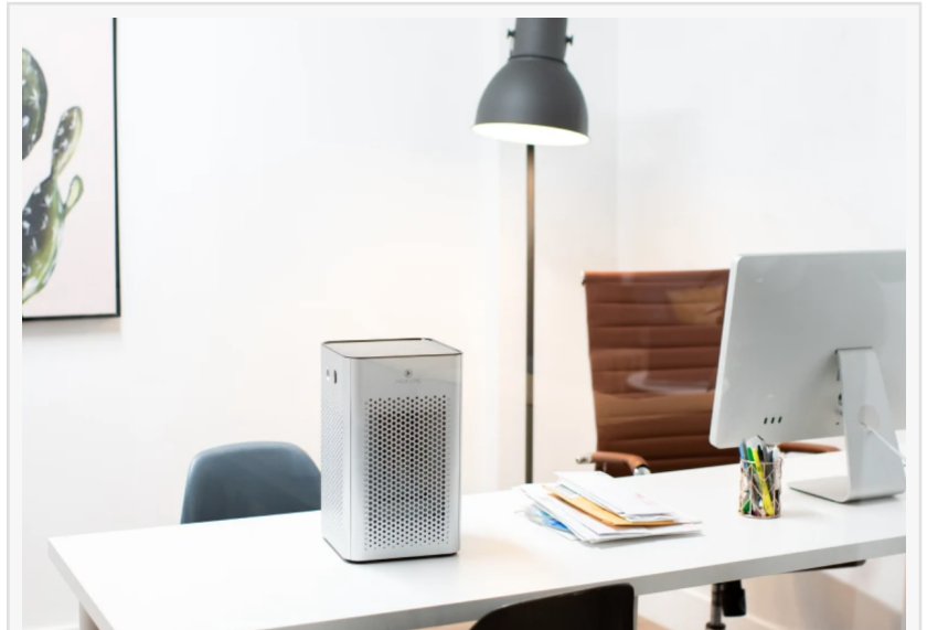
Medify Air offers some of the most affordable high performance air purifiers on the market.

CHICAGO, IL, USA, May 14, 2021 /EINPresswire.com/ -- As COVID-19 vaccination rates increase, and offices across the country prepare to welcome employees back, Chicago PPE and safety supply firm Buyhive is playing a vital role in helping businesses to make the transition. The company is partnering with Medify Air , a U.S.-based manufacturer of premium medical-grade air purifiers, to help executives plan for the return of remote, at-home employees back to the workplace.