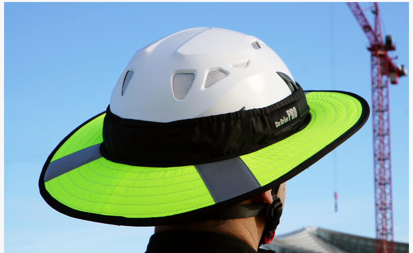
Da Brim PRO Tech Lite