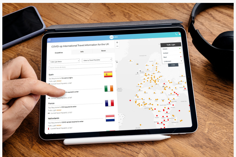
Travel information portal on iPad

BIRMINGHAM, UNITED KINGDOM, May 17, 2021 /EINPresswire.com/ -- During the pandemic, travel has been severely restricted. Now that the Government has launched a traffic light system designation for every country, UK residents are once again beginning to book holidays for the future.