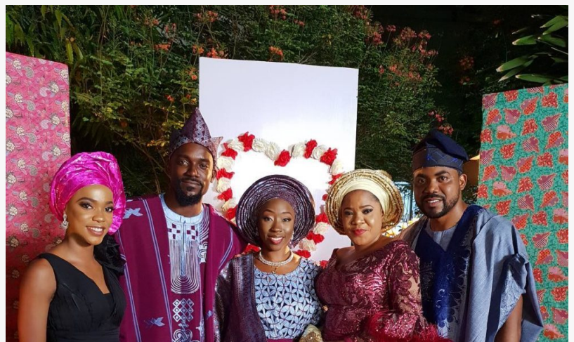
Watch "2 Weeks In Lagos" starring Mawuli Gavor & Beverly Naya