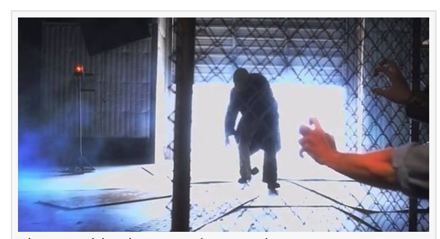
The Hunchback enters the caged arena

LOS ANGELES, CALIFORNIA, UNITED STATES, May 18, 2021 /EINPresswire.com/ -- "THE Hunchback OF BEL AIR" MOVIE: The film that cries out; think twice before bullying. Bullies might want to watch the movie that will send shivers down their spine. The long-awaited improv and ad-libbed